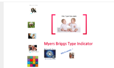
Myers Briggs workshop