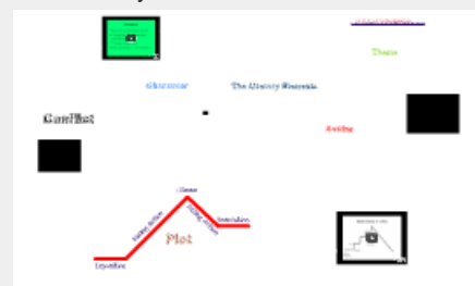
Plot, Character, Conflict, Theme, Setting