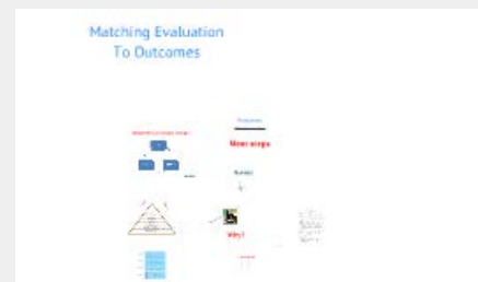
Copy of The Evaluation Guide